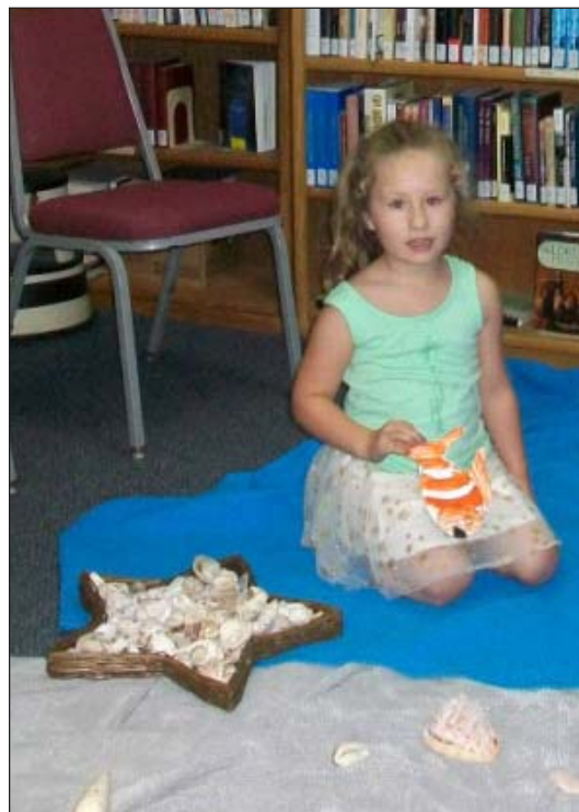
Catching a fish at the beach during a July session of Nana's Time Out in the FPC library. (More photos on page 5.)