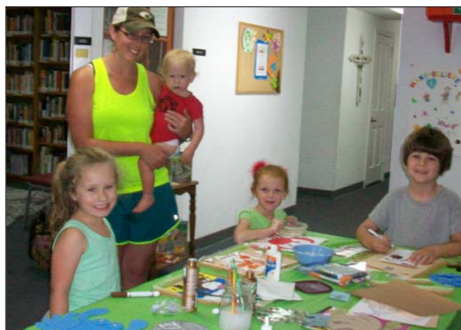
Nana's Time Out: Meeting new friends while making shell pictures and blue crabs.