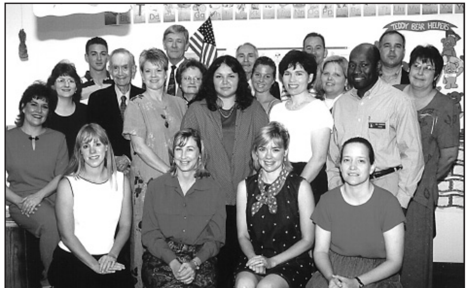
Sunday School teachers, 2001. (From A Celebration for All Times: A History of the First Presbyterian Church, Georgetown, Texas, Sesquicentennial Edition, 1854-2004)

—From A Celebration for All Times: A History of the First Presbyterian Church, Georgetown, Texas, Sesquicentennial Edition, 1854-2004