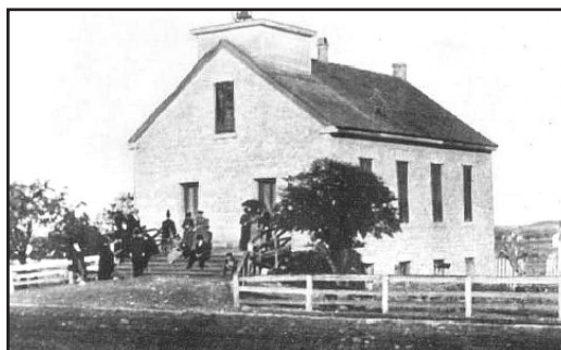
Earliest known photograph of the sanctuary, circa 1880-1884