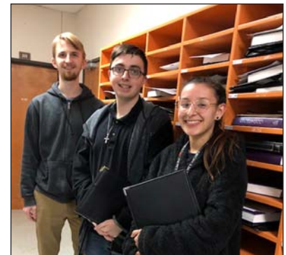
Meet the FPC Scholarship Singers who will perform with the Elijah choir, page 12.